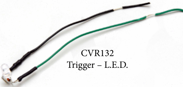
CVR132 Trigger - L.E.D.