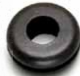
CVR133 Trigger - Grommet