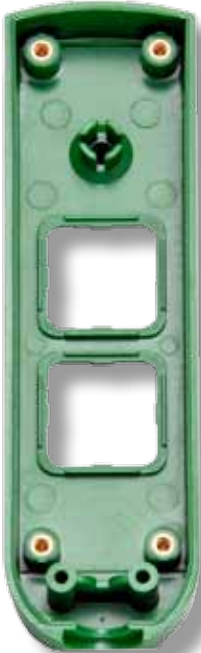
CVR129 Trigger - Housing - Top