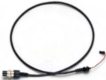
CVR141 Mic Pod – Cable