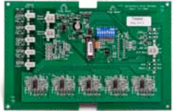
CVR107 Control Box – Circuit Board