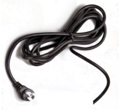
CVR152 PSU Power Cable