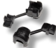
CVR151 Cable Clamp