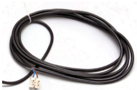
CVR153 PSU Pull Cord Cable