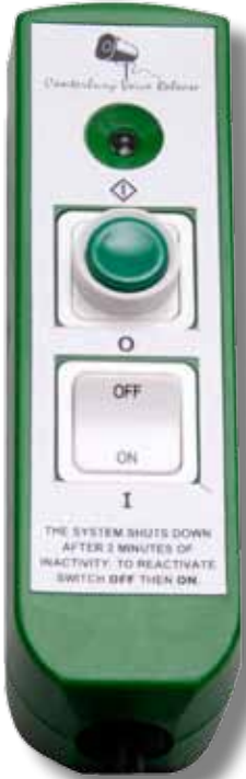
CVR124 Trigger Box Complete No Cord