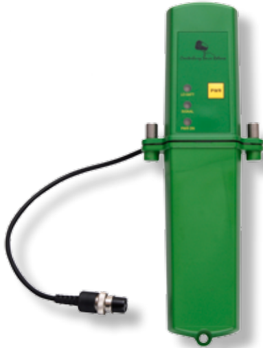
CVR134 Mic Pod