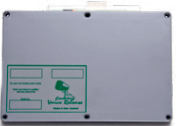
CVR108 Control Box – top only