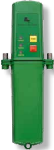
CVR135 Ref. Pod