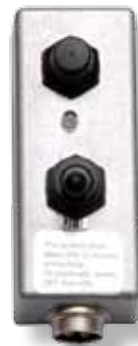
CVR114 Trigger Switch – Pierce Not Shown:

CVR169 – Trigger cable only – Pierce CVR170 – Pierce trigger unit only