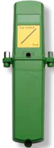
CVR143 Pod Box – Empty