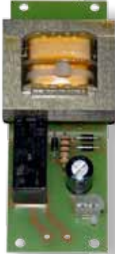
CVR147 PSU Circuit Board