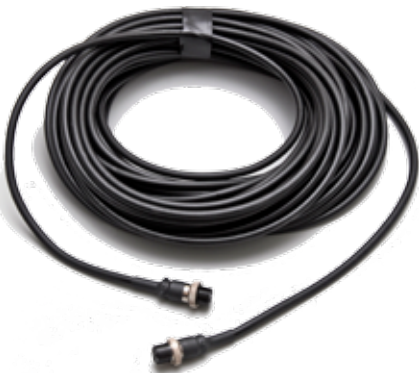
CVR117 3 Pin – Main Cable