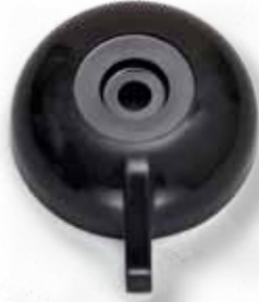
CVR112 Speaker – End Cap