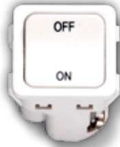
CVR127 Trigger - On / Off Switch