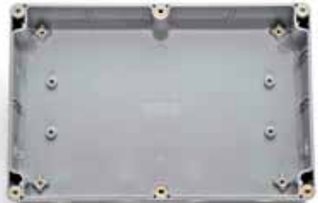
CVR106 Control Box – bottom only