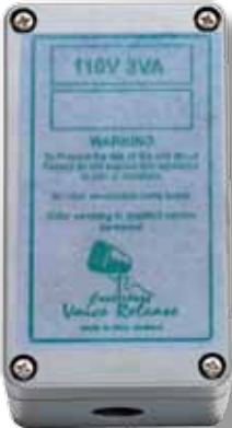
CVR146 PSU Relay Box - Empty