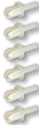
CVR166 Circuit Board Shield Mounting Pins (6) Pins