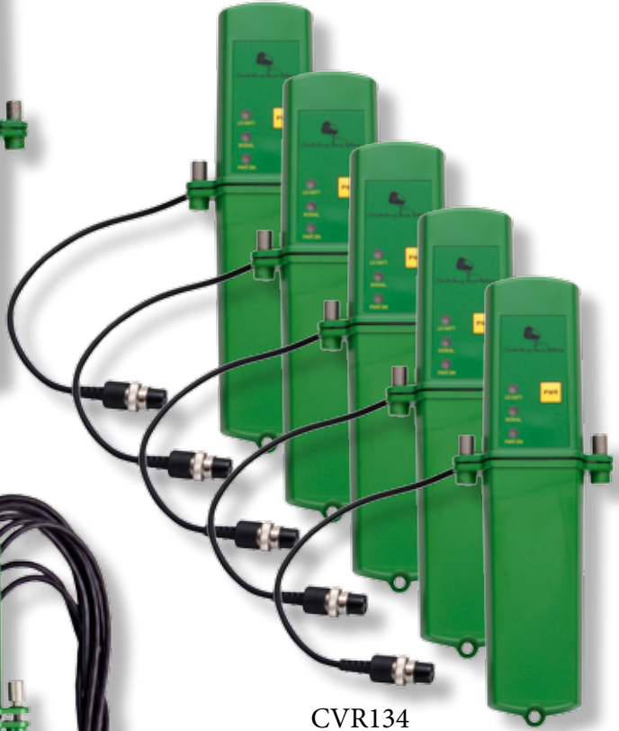
CVR134 Mic Pods