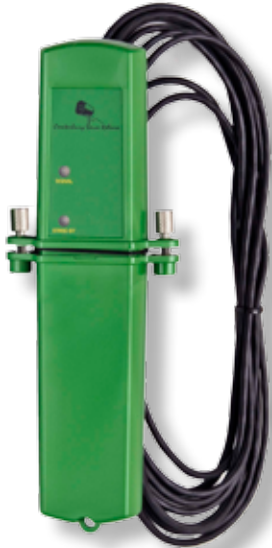
CVR136 Trap Pod Receiver