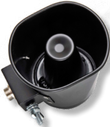
CVR111 Speaker – Aluminum