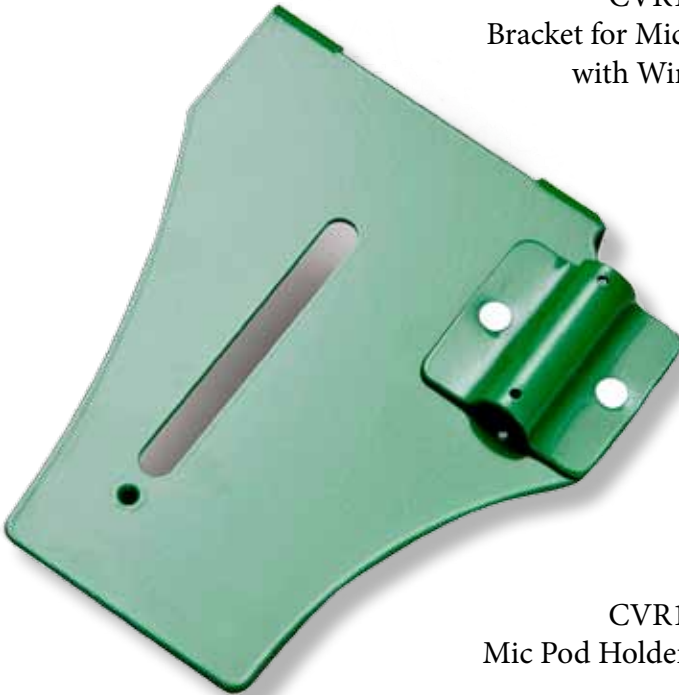
CVR156 Mic Pod Holder – Complete