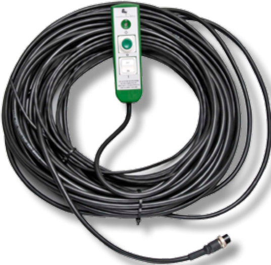
CVR115 Trigger – Trap with Cord