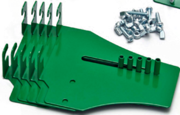
CVR162 Mic Pod Holder – Set of (5)