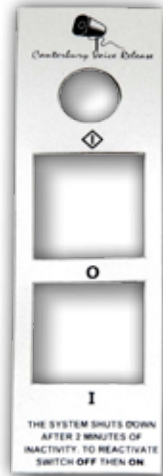
CVR130 Trigger - Decal