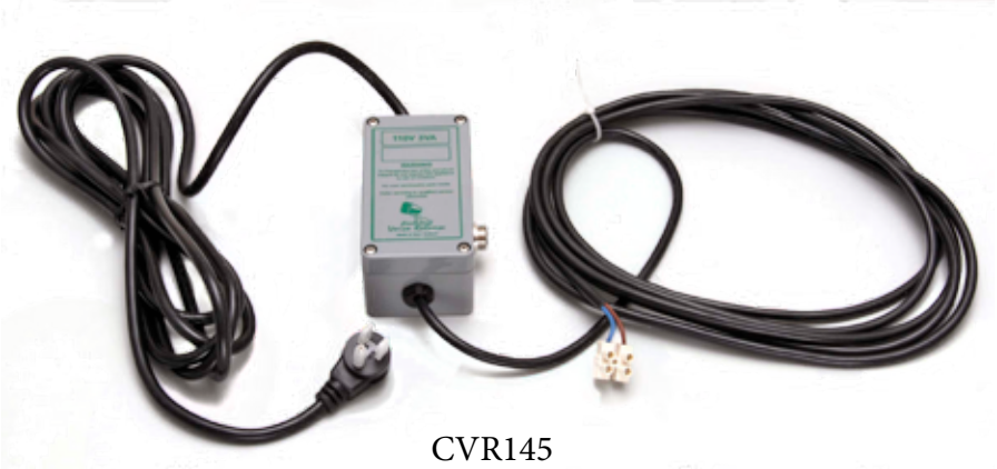
CVR145 Relay - PSU - Trap