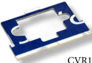
CVR154 Trap Pod – Support

5 each CVR162 1 each CVR154 1 each CVR155