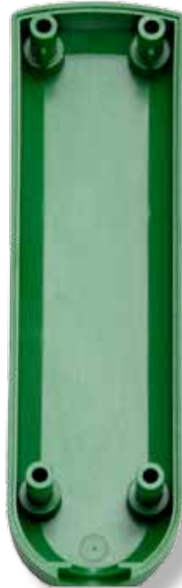
CVR131 Trigger - Housing - Bottom