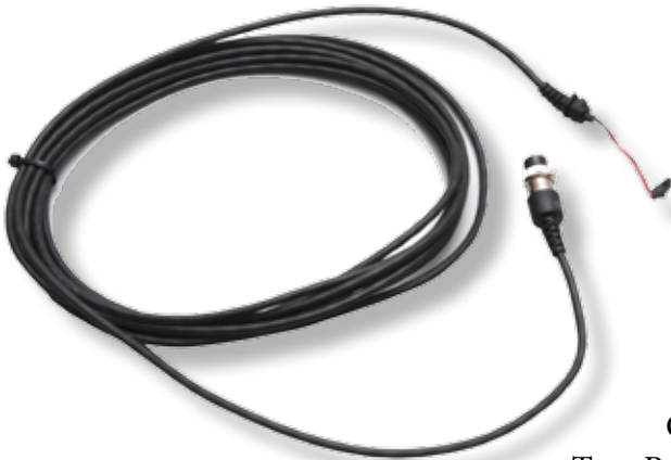
CVR144 Trap Pod – Rec. Cable