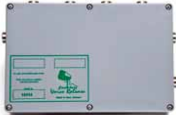
CVR105 Control Box – Trap