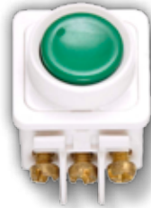
CVR126 Trigger - Release Button