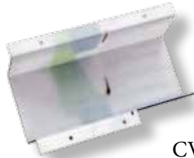
CVR155 Trap Pod – Guard