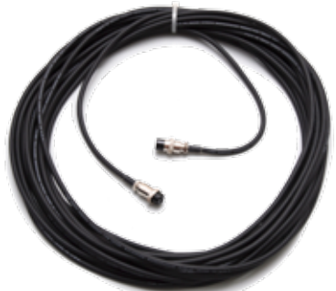
CVR116 Mic Cable