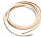
CVR110 Control Box - Cover Gasket