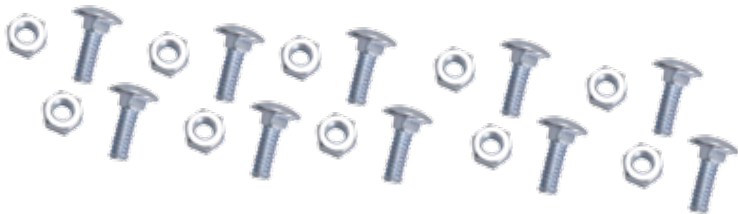
CVR161 Mic Stand – Screw Set (5)