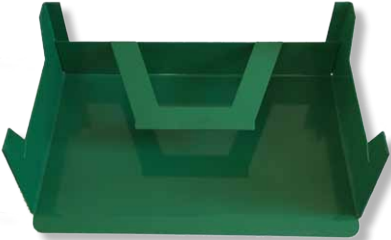
CVR163 Brain Box – Metal Cover & Holder