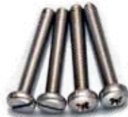
CVR128 Trigger - Cover Screws